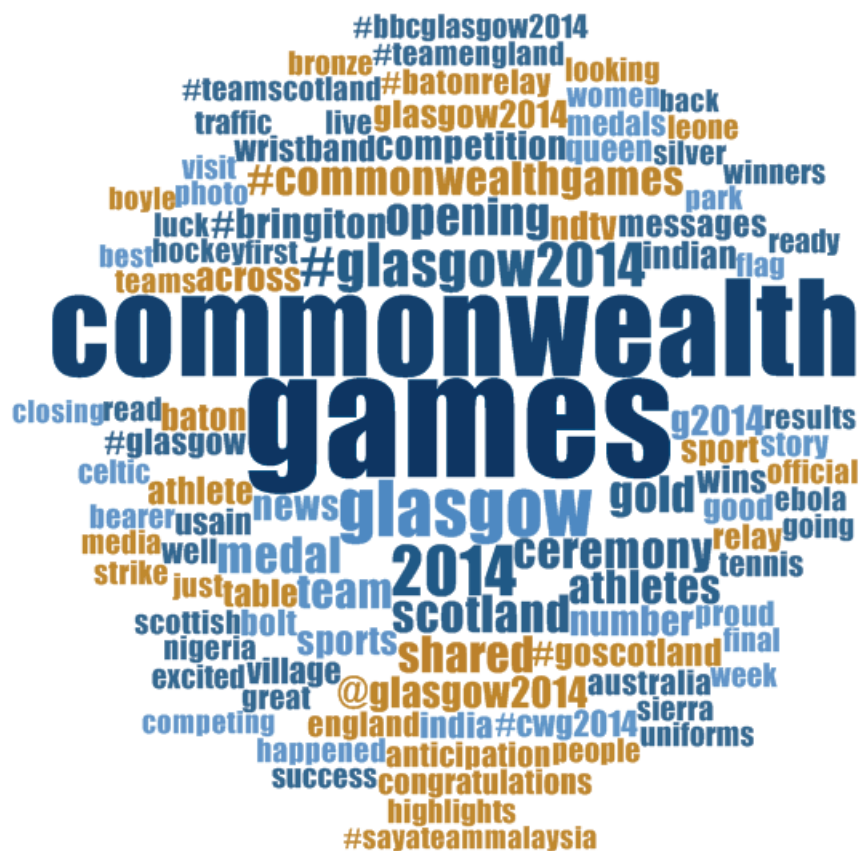
Figure 5.1. Commonwealth Games social media word cloud for the period 14 June to 6 August 2014.